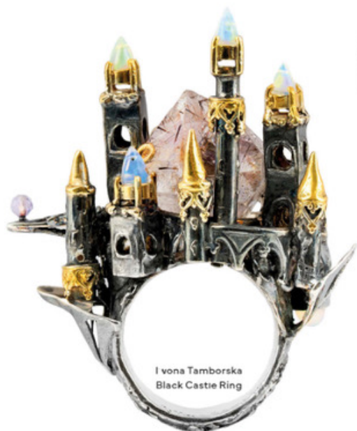
Ivona Tamborska Black Castle Ring