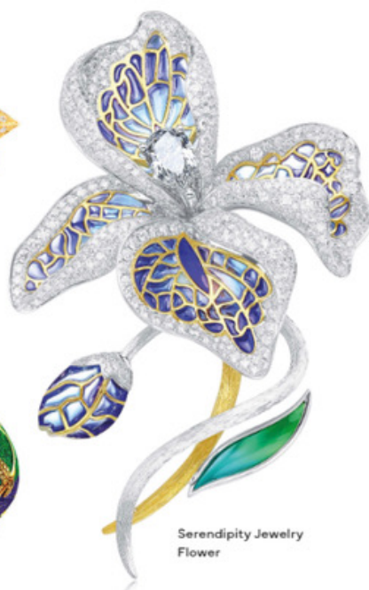
Serendipity Jewelry Flower

C an you tell PJ readers about what it's like to grow up with in a gemstone dealer family? Growing up with a father