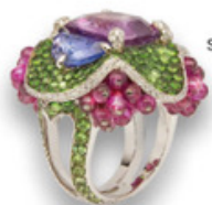
Marija Iva Fruit of the Vine Sapphire, Tanzanite, Rubellite and diamond ring