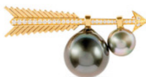
Marija Iva Black and white brooch set with pearls